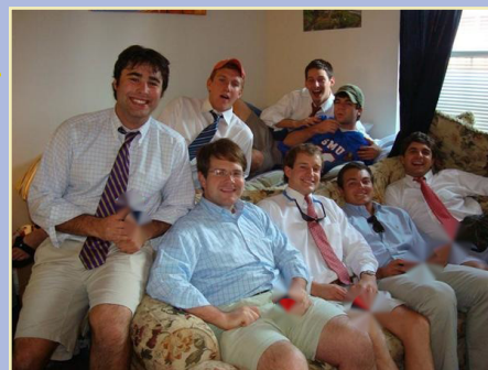
SAE's in Vice President's room at the House