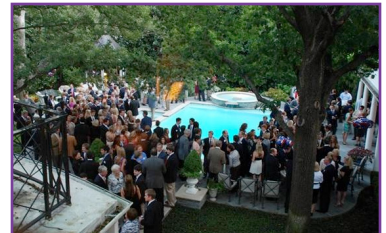
Parent Weekend at an Alumni's House