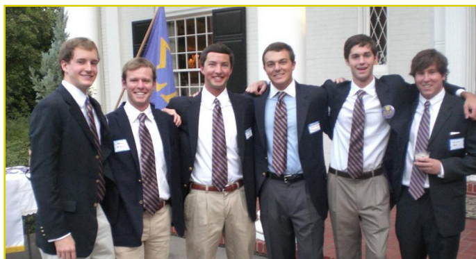
SAE Officers Greet Parents at Family Weekend - September 2008