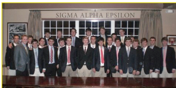
2009 SAE Spring Pledge Class