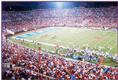
SAE alumni lease six suites, this is the SAE view from Minerva's Womb