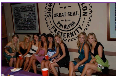
Beautiful Women of SAE