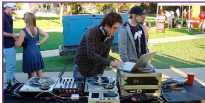
SAE Tailgate with DJ